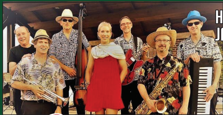
HUB CITY JAZZ