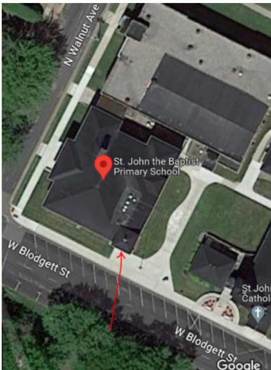
PRESCHOOL (Blodgett St.)